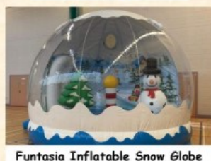
Funtasia Inflatable Snow Globe